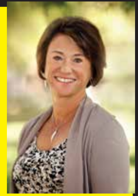
Professor of Psychology and Education