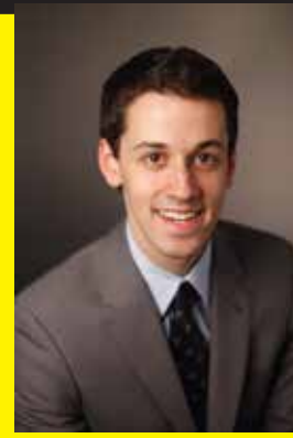
Assistant Professor of Education